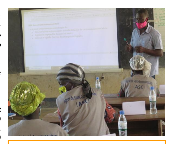
Contact tracing training in Togo to support efforts for COVID-19 infection, prevention and control.