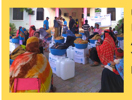
UNFPA-led Rapid Response Mechanism Activated as Floods Hit Yemen Read more...