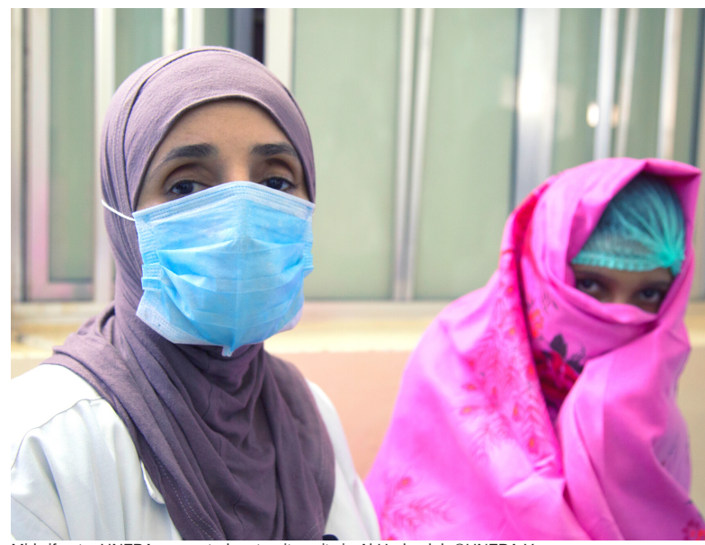
Midwife at a UNFPA-supported maternity unity in Al Hudaydah