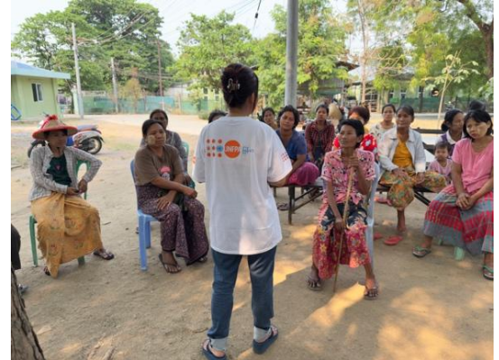
UNFPA staff disseminates GBV awareness information with women, including persons with disabilities.