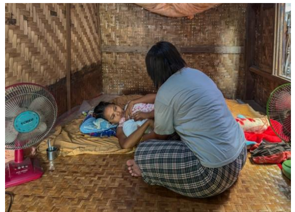
A local midwife provides maternal and newborn care to a woman from Mandalay.