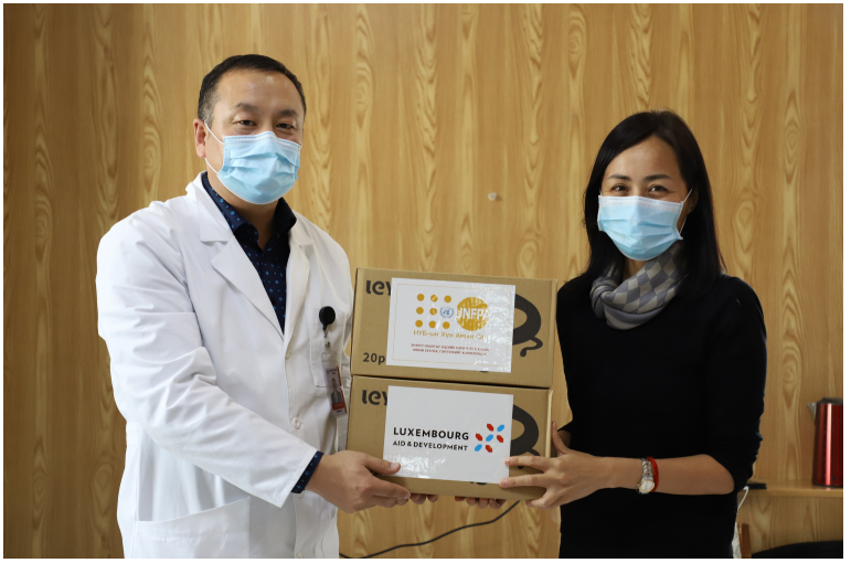
UNFPA Mongolia handed over PPE including face masks, goggles, disposable coverall and hand sanitizers to the General hospital of Selenge and Darkhan-Uul provinces.

In Umnugobi province, the medical team from the NCCD, together with local Department of Health officers, conducted the second round of comprehensive supportive monitoring of the sexually transmitted infections (STI) surveillance system. The STI surveillance system includes screening for STIs and gynaecological conditions as part of sexual and reproductive health services.