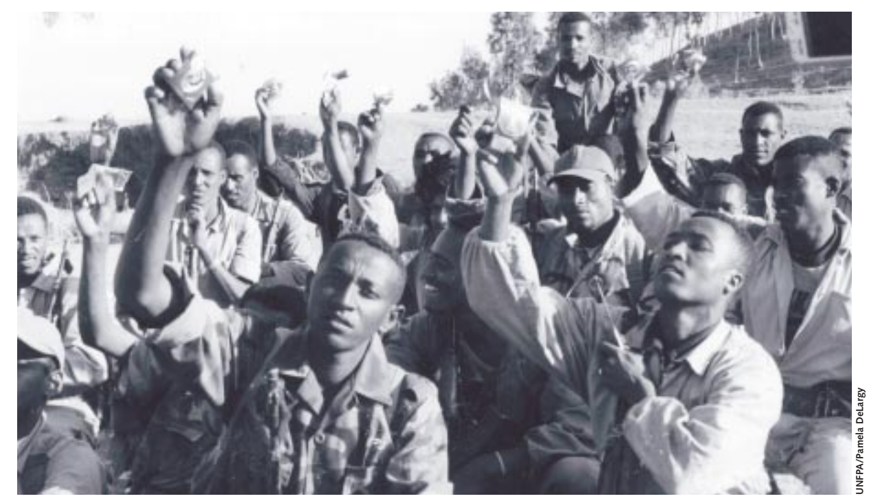
Demobilized soldiers in Ethiopia receive condoms, and education on their correct and consistent use, as part of UNFPA support after devastating armed conflict and drought. The men are also trained as health educators to prevent HIV/AIDS and counsel others upon their return home.

supports longer-term efforts to reduce HIV infection among still-vulnerable populations. Rapid needs assessments, counselling and training are also part of the UNFPA response.