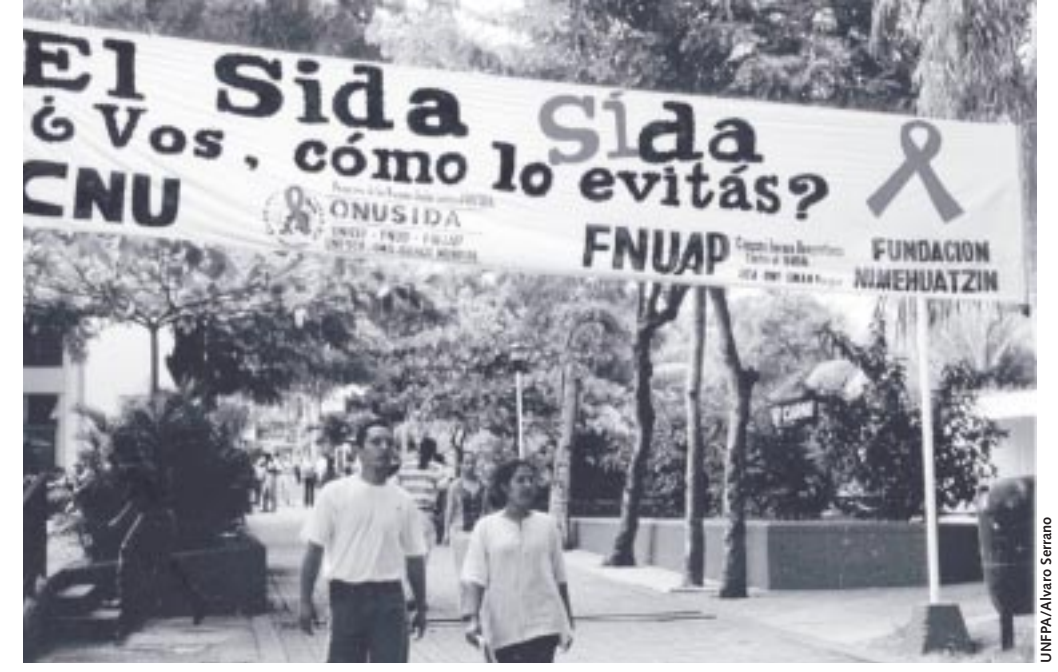
An HIV/AIDS education banner is displayed by university students in Nicaragua during a campus campaign to prevent infection among young people.

workers, long-distance drivers, men in the armed services, men who have sex with men, internally displaced persons, refugees, sex workers and their clients. Focusing on young people is always an effective strategy.