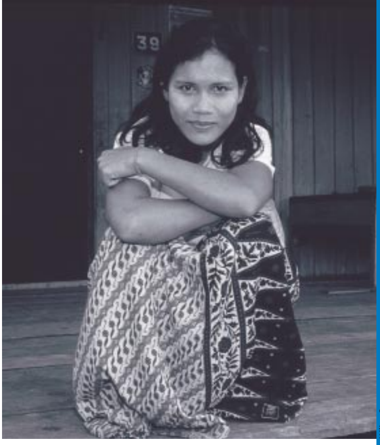
A young sex worker in Cambodia is at high risk for HIV infection. UNFPA supports targeted interventions to reach groups in which AIDS is spreading the fastest.

Prevention initiatives are designed in response to the situation in each country. Working closely with partners in governments, UNFPA emphasizes the integration of HIV prevention within the country programme development processes.* Programme components may include a comprehensive package of reproductive health services in areas such as maternal health; family planning; adolescent