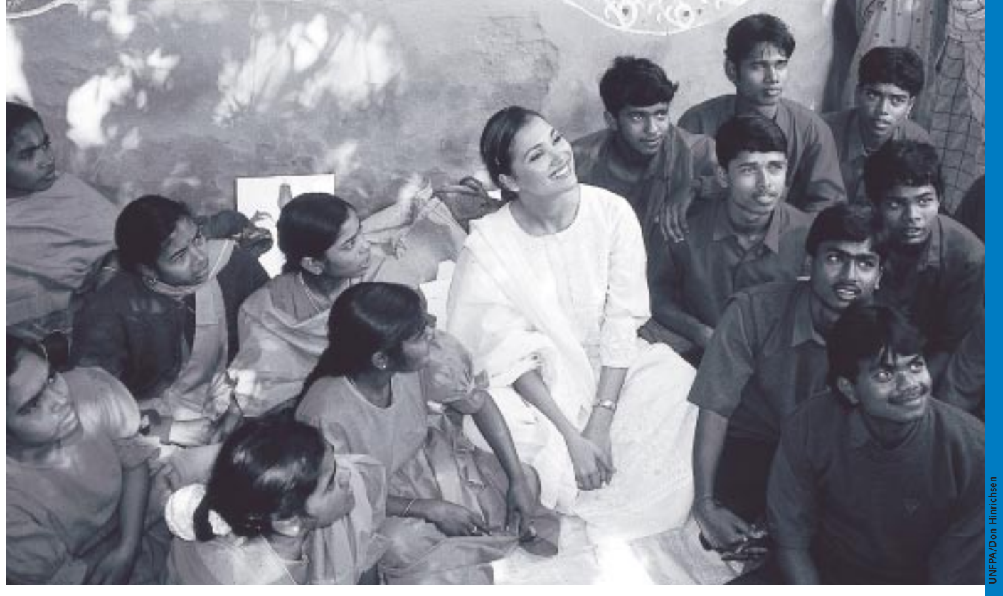
UNFPA Goodwill Ambassador Lara Dutta, Miss Universe 2000, speaks with young people in India about preventing HIV/AIDS.

The number of new infections is rising steeply in Eastern Europe and Central Asia. In the Russian Federation, reported HIV infections increased from 11,000 in 1998 to 129,000 in 2001. The region hosts the fastest-growing epidemic in the world, fueled by high rates of injecting drug use among young people and high levels of other sexually transmitted infections. Some 250,000 people were newly infected with HIV, bringing to 1 million the number of people living with HIV/AIDS.