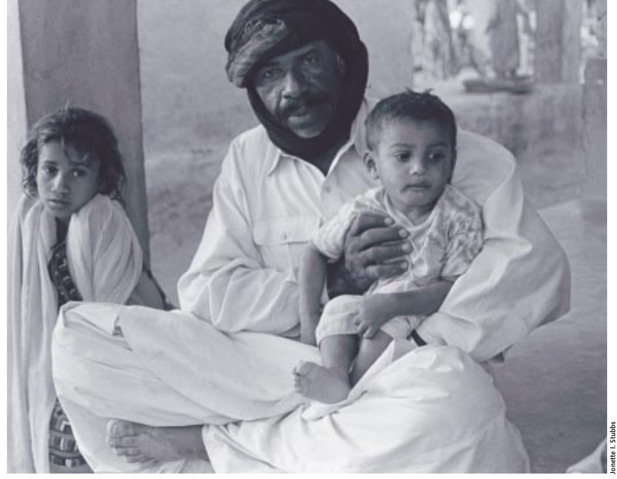
Men, like this Pakistani father with his children, are encouraged to take responsibility for protecting themselves, their partners and the well-being of their families by preventing the spread of HIV through safe and responsible sexual behaviour.

poverty. UNFPA supports programmes that provide reproductive health information and services and advance the right of women to exercise control over their lives and their sexuality. Women, especially young women, need to be empowered to say NO to unsafe sex, to abstain from sex and to avoid the risk of infection.