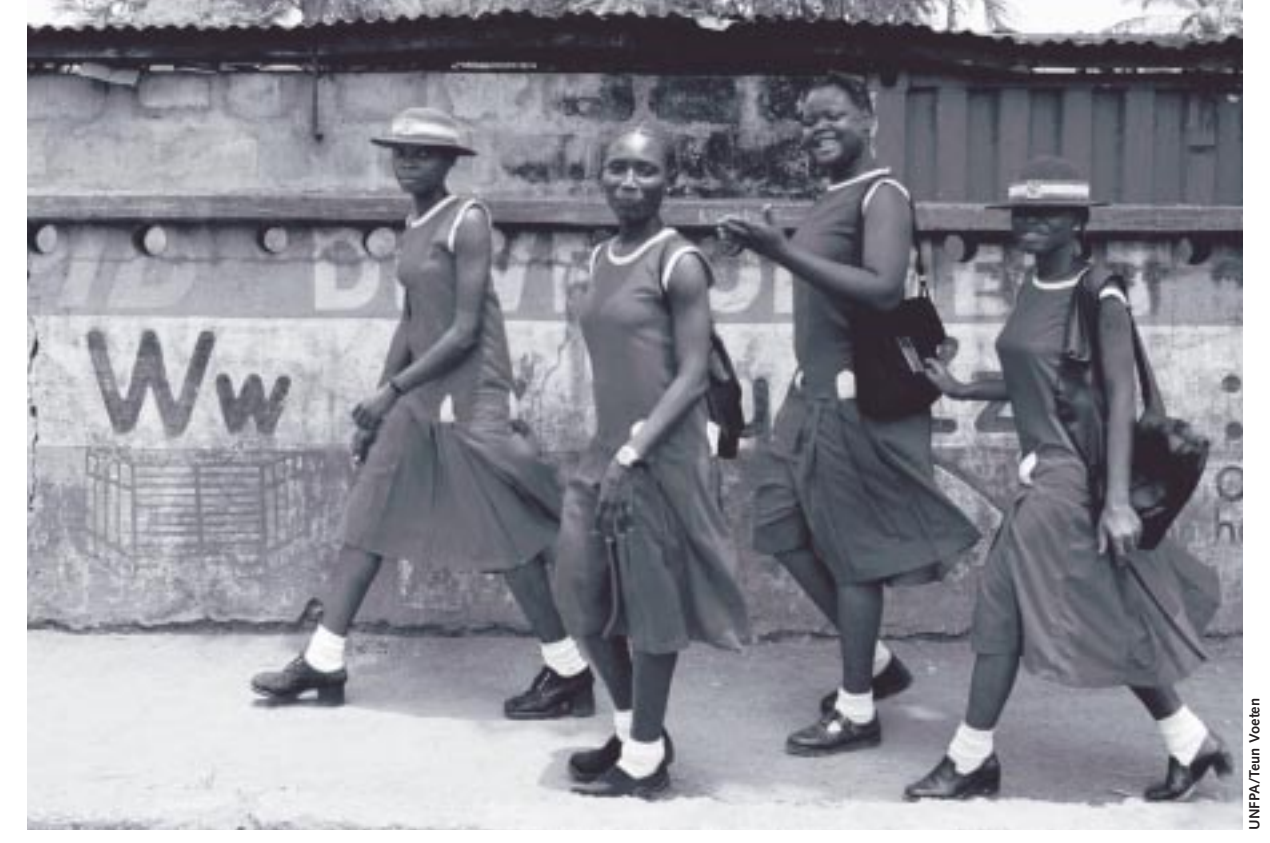
Educating young people like these schoolgirls in Sierra Leone is the first step in preventing HIV/AIDS and promoting lifelong reproductive health. UNFPA supports peer education projects and youth-friendly information and services.

the virus. Many millions more know nothing or too little about HIV to protect themselves against it. UNFPA supports programmes that promote healthy adolescent development and, among sexually active young people, safer and responsible sexual behaviour. Access to culturally sensitive and youth-friendly reproductive health information and services is a priority for protection against STIs, including HIV, and unwanted pregnancy.