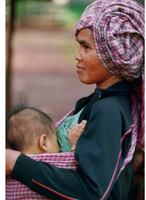
Woman carrying her child in Cambodia.

One priority activity in Cambodia relates to the anticipated increase in institutional deliveries associated with the introduction of performance-based support schemes to encourage women to give birth in a facility. In response, Cambodia has requested funding to increase the quantity of midwives trained and the quality of training through support to the Cambodian Midwives Association, midwifery schools and regional training centres. Support will also contribute to an on-site refresher training in emergency obstetric and newborn care for doctors in district hospitals. An EmONC national assessment is also ongoing in Cambodia. Results will be released in 2009. The country will seek support from the MHTF to support the implementation of the EmONC Improvement Plan from 2010 onwards.