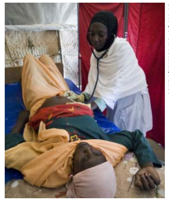
A midwife examining a pregnant woman in a UNFPA-supported clinic located in Darfur.

ternal Health (IDWG-MH). The IDWG-MH is a coordinating body made up of members who represent UNFPA's regional offices and the various divisions at Headquarters, including the Resource Mobilization and Media Communications Branches, the Humanitarian Response Branch, the Commodity Security Branch and the Sexual and Reproductive Health Branch. The IDWG-MH meets to peer-review proposals from the countries and regions and to provide guidance and coordination of the activities of the MHTF. The group met nine times at the working level and once at the policy level in 2008. The working level team has been a great example of coordination around maternal health across the regional and Headquarters divisions. The Group acknowledged the changes in its composition over the year due to the regionalization process and the relocation of regional offices. Moving forward, the greater number of staff members in the region will bring to the group a better perspective on how activities supported by the MHTF are being implemented on the ground.