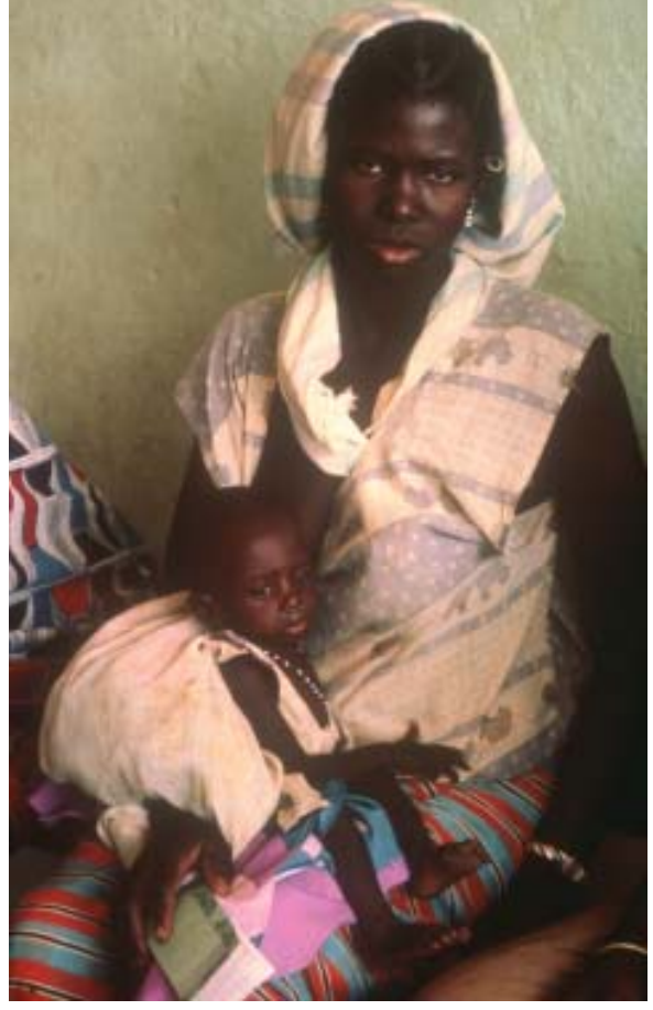
Women and her child in Burkina Faso.

Burkina Faso is in the process of strengthening its maternal health programming as part of its sector-wide approach and with support from UNFPA, UNICEF, WHO and modest resources from a grant from the Bill & Melinda Gates Foundation. Key priorities include meeting the unmet need for family planning,