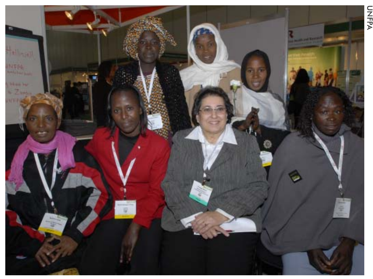
Executive Director, Thoraya Obaid and fistula recovery patients at the Women Deliver Conference in November 2007. The conference raised awareness for the fistula campaign as well as maternal health.

The Maternal Health Thematic Fund received $25 million in pledges and/or contributions for 2008 from the following donors: Austria, Finland, Ireland, Luxembourg, The Netherlands and Spain; included is a contribution from Sweden for the Midwifery Programme which is now fully integrated within the MHTF (Please see separate annual report of the Midwives Programme). The funding target for 2008 has thus been met. Sweden announced at the January 2009 UNFPA Executive Board that they would provide additional support. Active discussions with other key donors are underway.