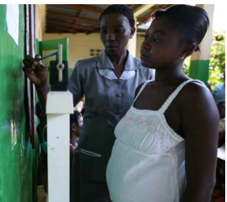
A pregnant woman being weighed at a UNFPA-supported health centre in Ouanaminthe, Haiti.

Haiti is also using funds from the MHTF to strengthen the National School of Midwifery. The country will recruit a national and international midwife adviser in 2009 through the MHTF Midwifery Programme. The Thematic Fund will allow an increase in the quantity and quality of new midwives. For a list of all key priorities in Haiti, see the box on page 8.