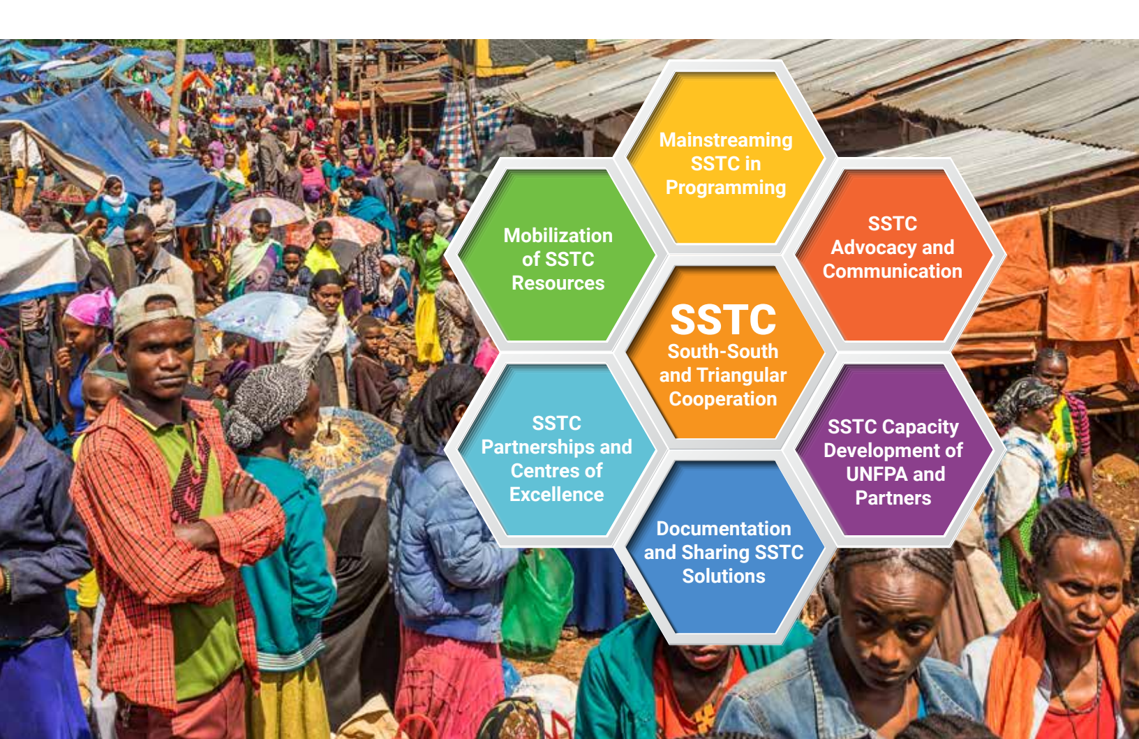
FIGURE 1. OPERATIONAL FRAMEWORK