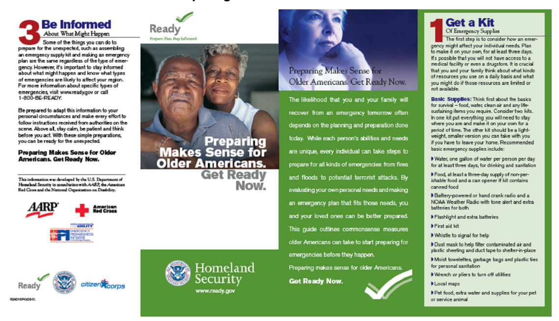
Box 13: Preparing Makes Sense for Older Americans

In addition to meeting the needs for assistance of older persons in the immediate aftermath of a disaster, the Madrid Plan draws attention to the contribution older persons can make in reconstruction and rehabilitation.