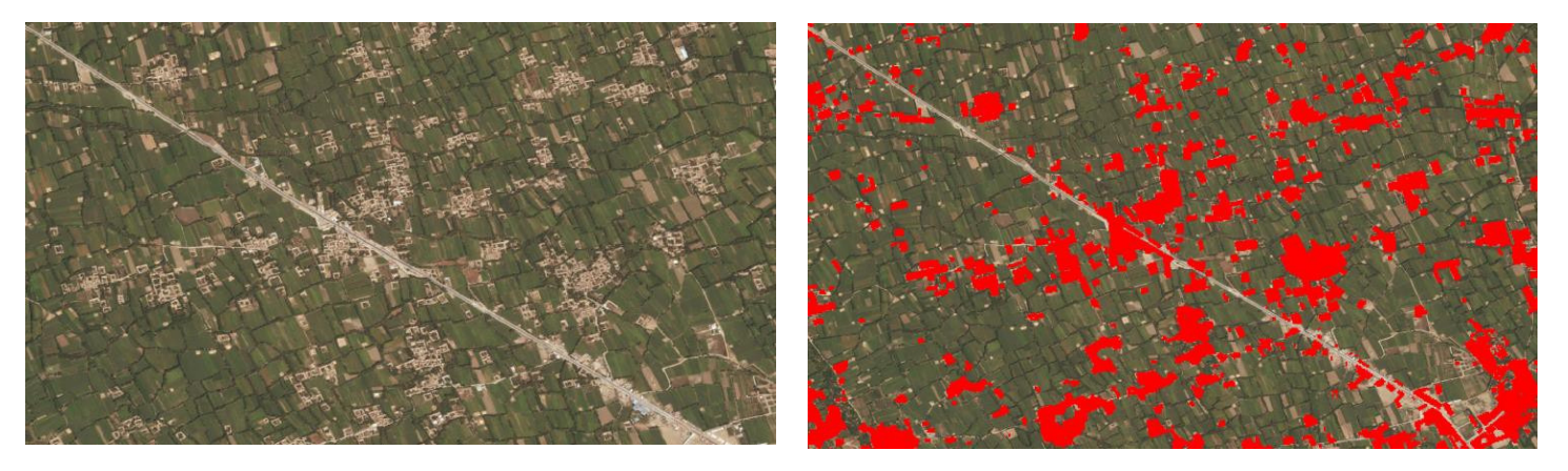
Figure 1: (left) High-resolution satellite image of a rural area of Afghanistan; (right) Settlement areas detected automatically by computer algorithms.

Despite its many advantages, a hybrid census can, however, never replace the richness and level of detail on the individual, family, household or community level generated by a traditional population and housing census.