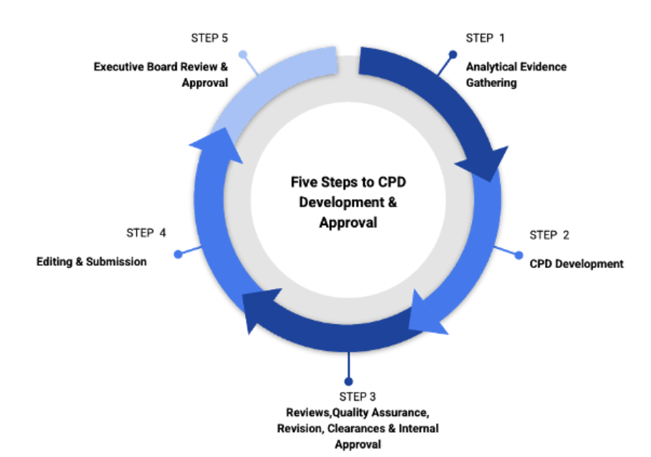
Figure 1: Five steps to CPD development and approval

The CPD development typically follows <u>five key steps</u>, as shown in Figure 1 below.