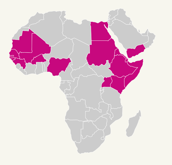
Figure: Joint Programme Phase II geographic coverage

The purpose of the evaluation is to assess the extent to which, and under what circumstances, the UNFPA-UNICEF Joint Programme on the Abandonment of Female Genital Mutilation (FGM) has contributed to accelerating the abandonment of FGM over the last ten years. The evaluation also provides recommendations on how to accelerate change to end FGM.